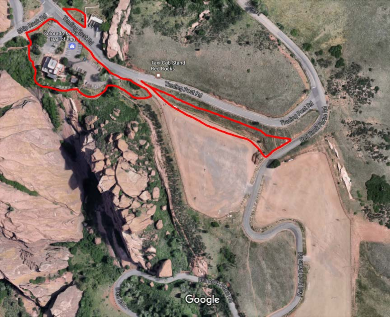
The areas around the Red Rocks Trading Post and along the large swale near the parking lot are possible sites for permanent or semi-permanent public art.