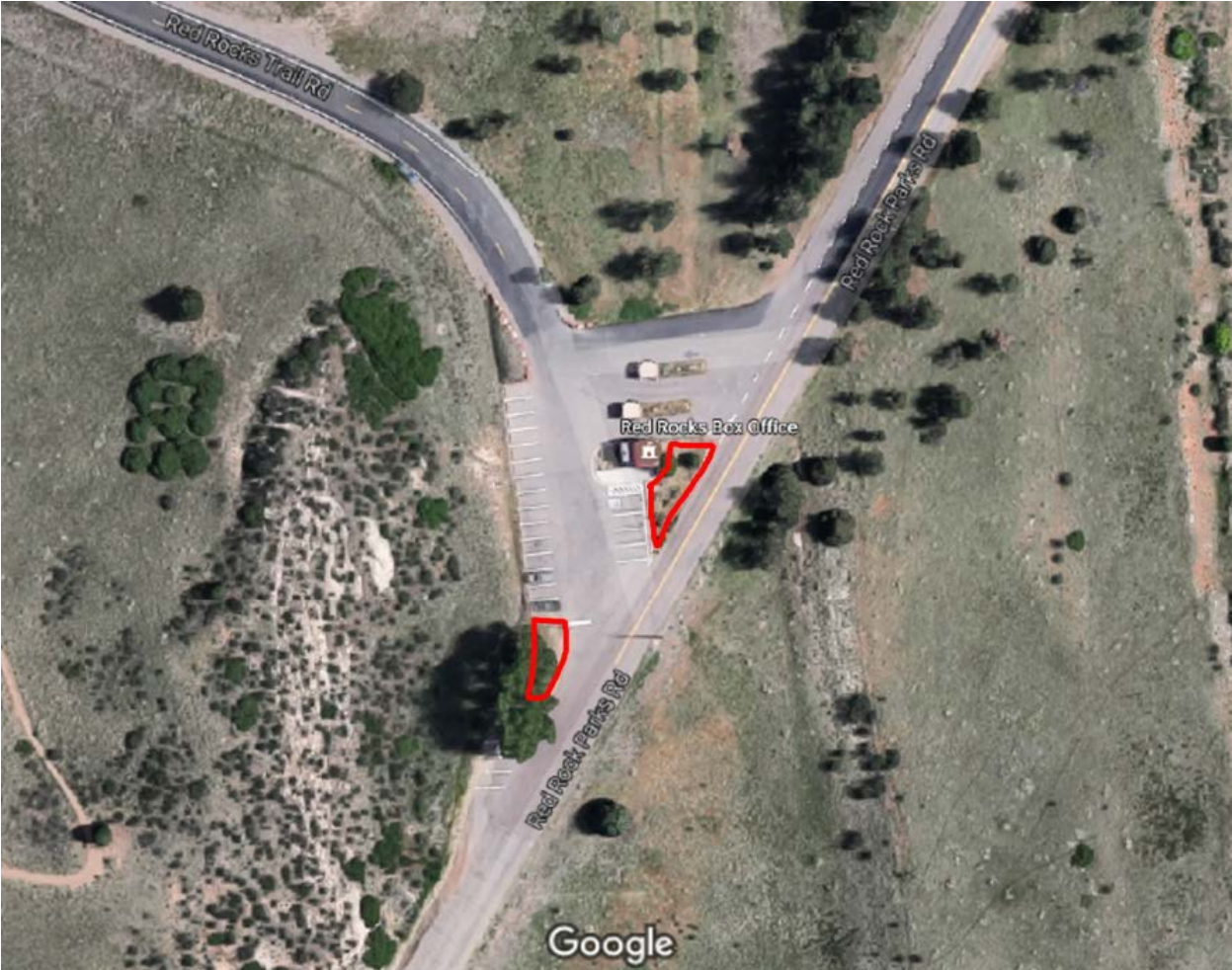
Areas near the Red Rocks Box Office that are possible sites for permanent or semi-permanent public art.